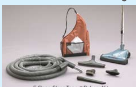
E-Class CleanTeam<sup>®</sup> Deluxe Kit