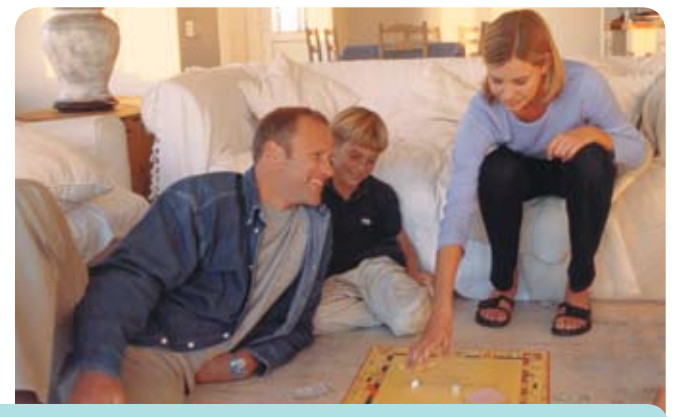
You want to do the best for your family. So what is the best way to ensure a clean living environment?

Since most of us spend 90% of our time indoors, poor indoor air quality can affect health, safety and comfort, especially in children and the elderly. According to the U.S. EPA, indoor air pollution is America's most serious environmental health problem. The American College of Allergists also reports that 50% of all illnesses are caused by, or aggravated by, polluted indoor air.