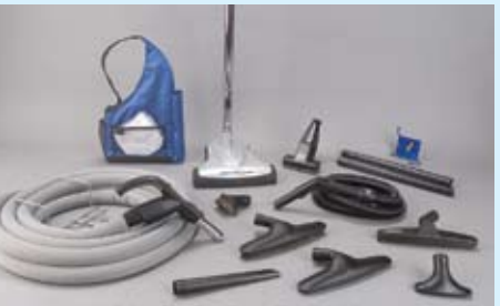
White Glove" CleanTeam" Kit